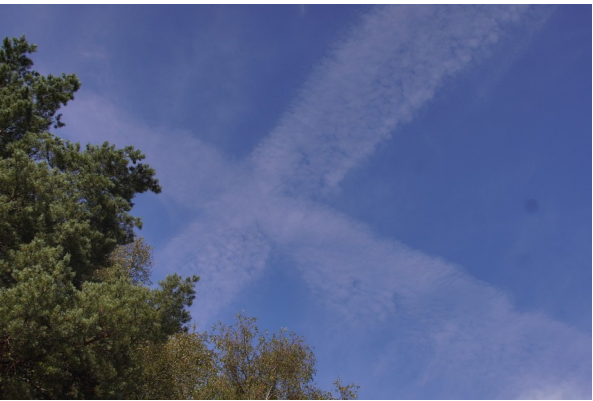
Clouds on a clean sky.